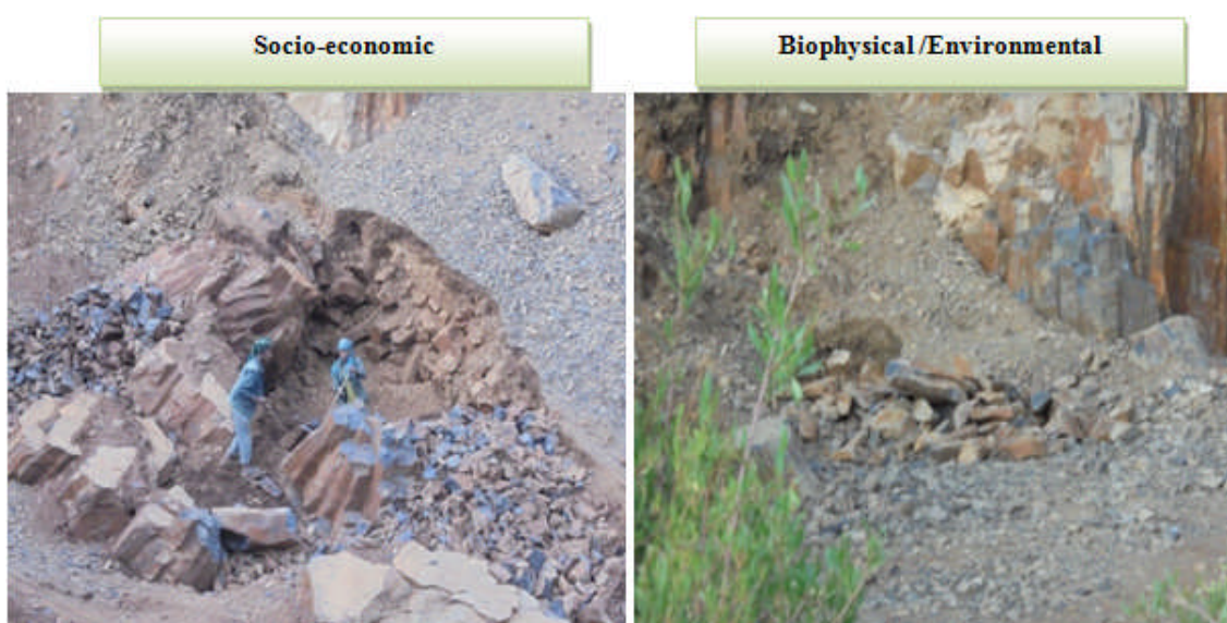
Plate 1. Land degradation due to socio-economic and biophysical influence.

“I do not have to complain about nature rather, my complaint is on the people who changed the natural settings by exploiting the land (Plate1). Before, the mining investors came; there was dense vegetation in our surroundings. After mining investors start, the vegetation becomes bare and the land lacks moisture. Even the malaria outbreaks increased”.