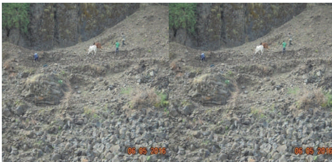
Plate 2. Land slide in the lowlands of the district.

Livestock disease: in the study area climate-induced disease has created health shocks. The seasonal calendar shows that August, September, and October months are high in disease outbreaks, whereas, the month of June and May are low disease occurrence. In the district, animal diseases are; the Black leg, Anthrax, Foot and mouth disease (FMD). Besides, the key constraint to improved livestock productivity remained inadequate feed resources, especially in the dry season. According to the FGDs, when livestock diseases occurred, the threat to the farmers' livestock production is found much severe in all agro-ecology zones of the district. There are a decreasing pasture availability and quality as well as increasing water stress.