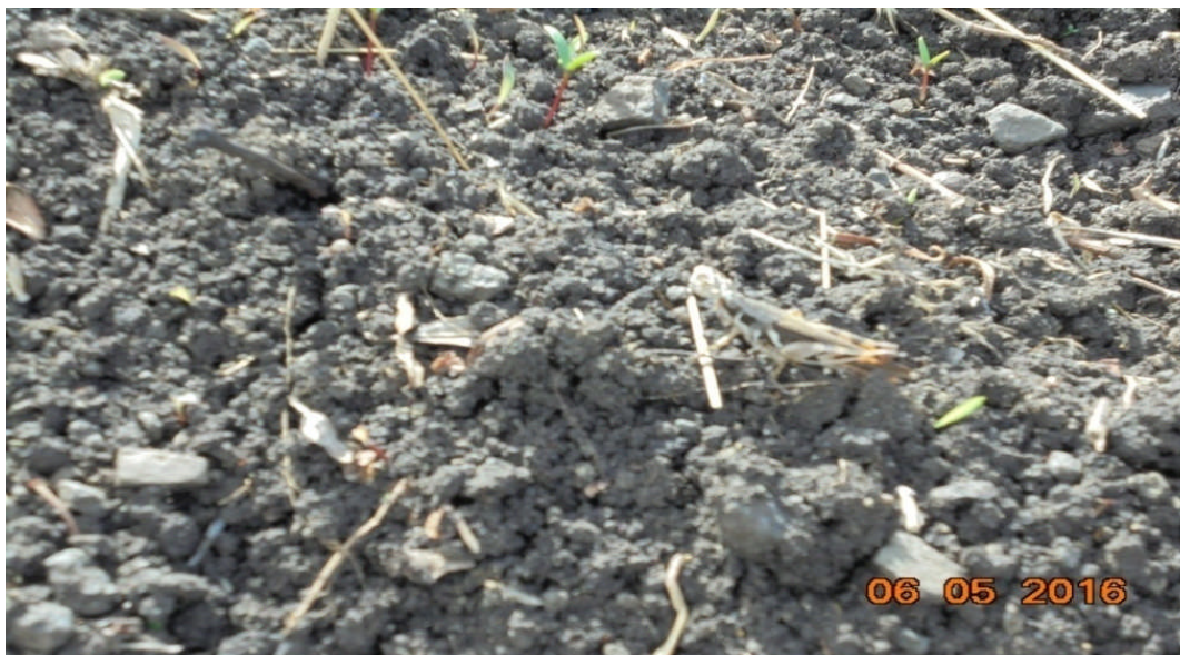
Plate 3. Outbreaks of Locust in the lowlands of the study area.

dry period/Bega). During drought years the surveyed households lack water at least for three months and less than one month during normal years.