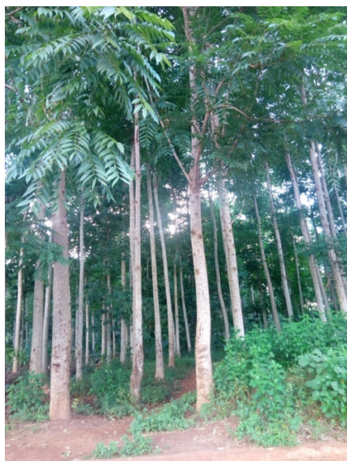
Plate 3. 2010 – 2017 at demonstration site 1 - at Dantano

Figure 2 indicates strengths, weaknesses, opportunities and threats (SWOT) analysis of tree planting. The main strengths of tree planting includes: trees grow and develop to provide shade for cocoa and plantain ( Musa ABB ) (11%), tree litter adds organic matter to the soil (78%) thereby contributing to the maintenance of soil fertility while a lot of the tree help create a conducive micro-climate for the general agricultural activities (11%). However, tree planting exhibits weaknesses such as arduous task demanded by