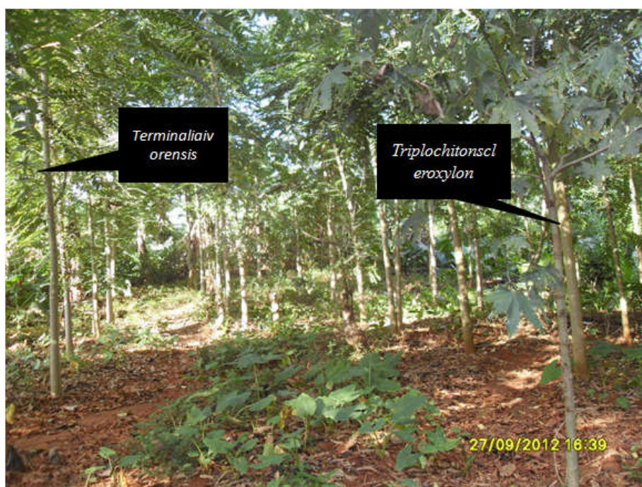
Plate 2. Two years later at demonstration site 1 – success story at Dantano Source: The Author 27 th September, 2012.

eliminated. The effect of the weeds on the land is drastically reduced by the good performance of the trees in barely two years. Plate 3 shows the success story at Dantano for nearly seven years of implementation.