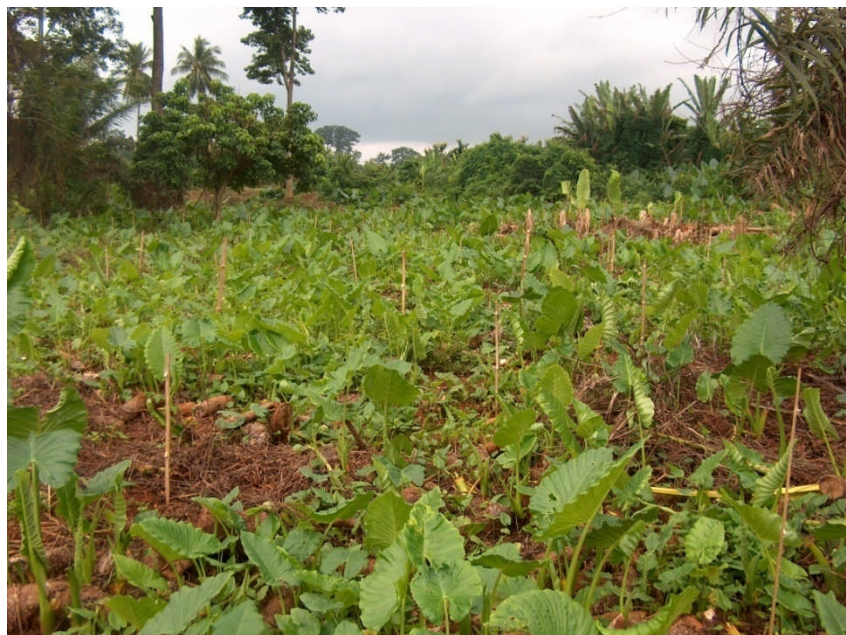
Plate 1: Demonstration site 1 – afforestation to recover swamp land at Dantano 24 th June, 2010.

Plate 2 portrays impacts of vegetative land cover conversion from swamp and invasive elephant ear plant to appreciable tree heights and well-developed tree canopy. The test looks successful although the elephant ears plant is not completely